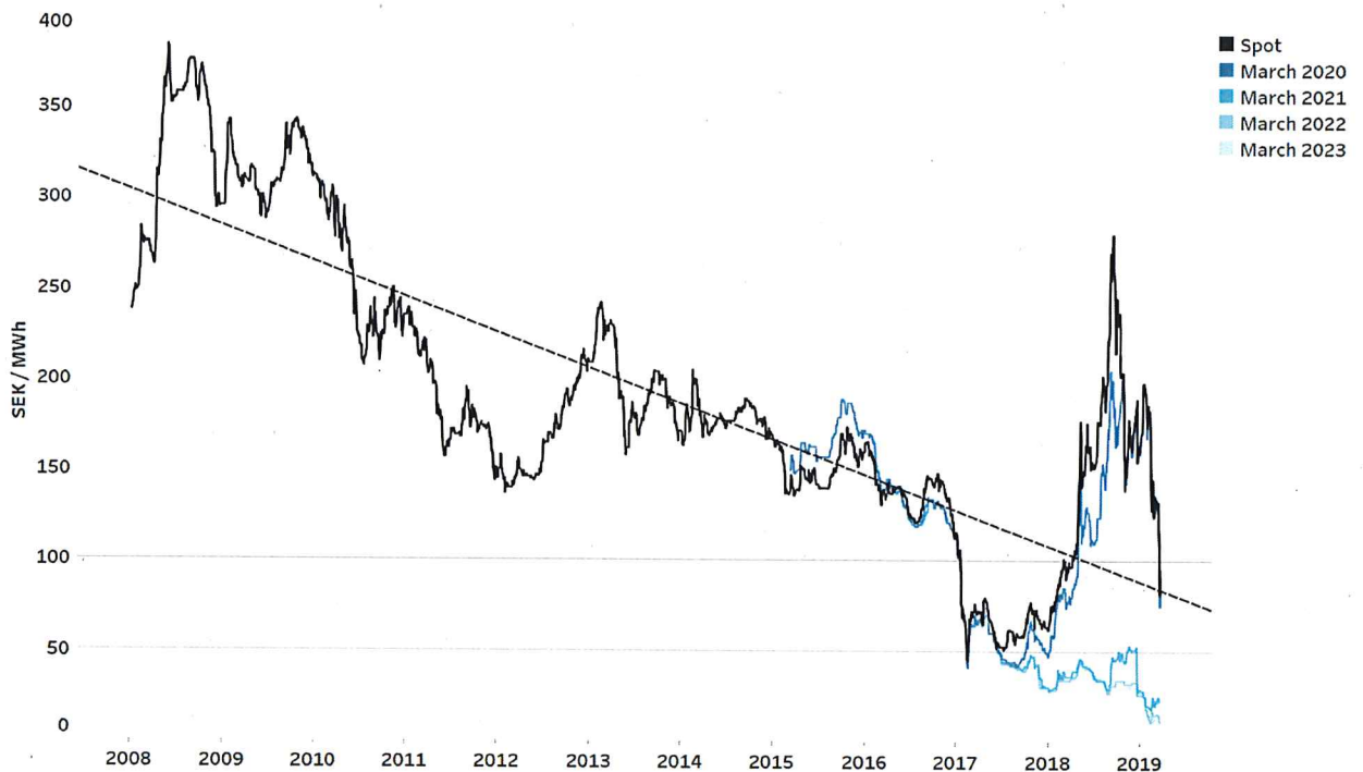
Figure 1: Elcertifikat spot price with according trend line and forward prices